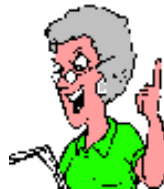
Notes about Ava Banana