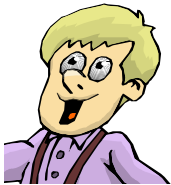
Notes about Ryden High